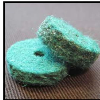
Front rail punchings

The felt used for backrail cloth, as well as the balance rail and front rail punchings, is a very thick, dense felt that is designed to stand up to decades of constant use.