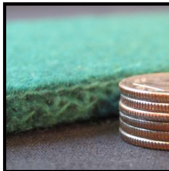
Back rail cloth

As the keybed felts harden and wear thin the keys become uneven in height from note to note. Also the amount of downward stroke (key dip) begins to vary, resulting in an action which has an uneven touch. A perfectly level set of keys with a uniform amount of key dip is essential to a piano action which is performing up to its potential.