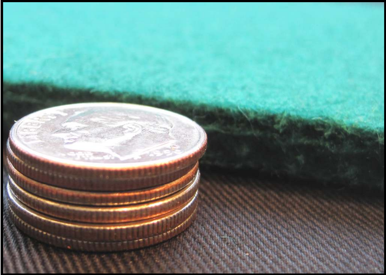
The thickness of heavy backrail cloth equals that of six dimes.