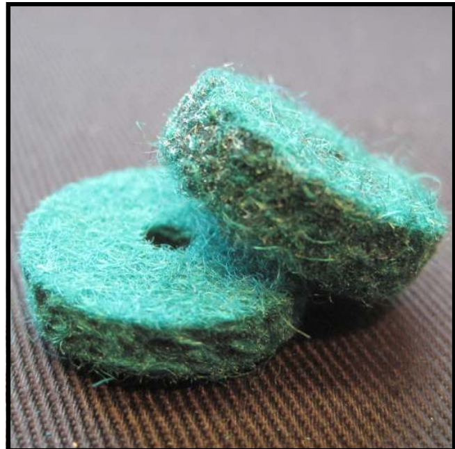
Thinnest and thickest front rail punchings.

Keybed felts come in a range of thicknesses, so that the original size of the felt installed at the factory may be duplicated. Paper and card punchings as thin as .002" are used under the felts for final adjustments necessary for level keys and even key dip.