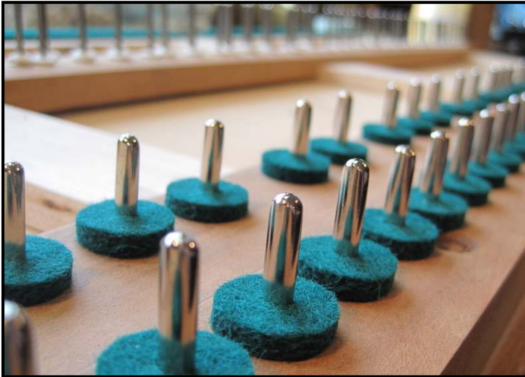
New set of keybed felts in place.

"In business to bring your piano to its full potential."